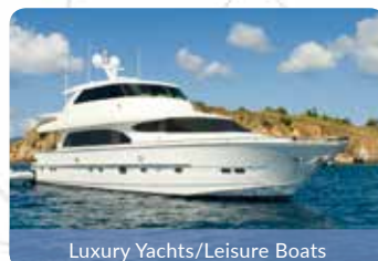
Luxury Yachts/Leisure Boats