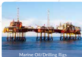
Marine Oil/Drilling Rigs